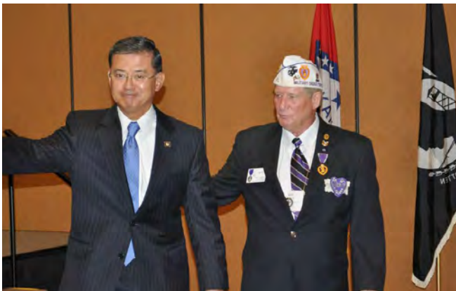
Secretary of Veterans Affairs Eric K. Shinseki spoke during the opening reception and meeting at this year's Military Order of the Purple Heart 81st Annual National Convention in Rogers, Ark.