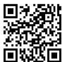
beanstack tracker app

We now have Beanstack at the Montpelier Library! What's that? It's a fun and easy way to log your reading time and earn prizes. This year we have both ADULT and YOUTH challenges. You can even sign up the entire family under one account. Get signed up and challenge your friends to keep up with you. You don't even need a library card to participate, so what are you waiting for?! Go to montpelierpubliclibrary.beanstack.org or download the beanstack tracker app to get started. Need help? Drop into the library.