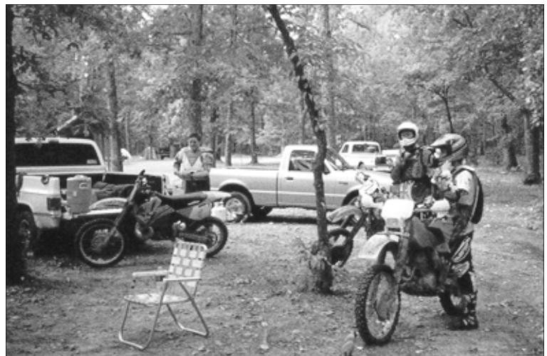
Getting ready for a Sunday morning ride.

It wasn't that bad. Provided you know the lines, you don't stall, and no one stalls in front of you. If you do stall going up a rock ledge, then you get to roll backwards in total darkness, unless you taped a flashlight to your helmet.