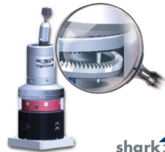
shark360 measuring mechanism