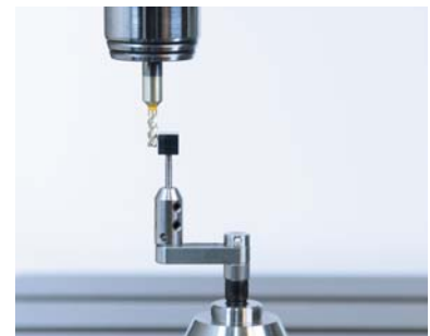
Tool radius measurement with special probe configuration