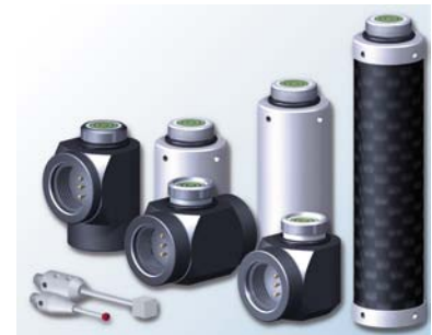
Various accessories available

* Depending on geometry and material of tool, probing force must not result in damage of tool