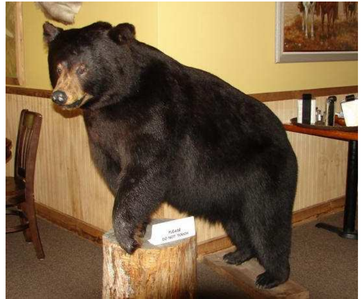
Met this guy at the Inn. He was just like us after we finished eating -stuffed (Groan!!)