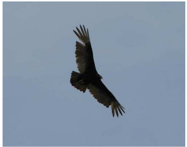
A Thunderbird looking for it own kind? Spotted during the Walpack cruise.

Remembering our Armed Forces Victory in Europe May 8th Armed Forces Day May 18th