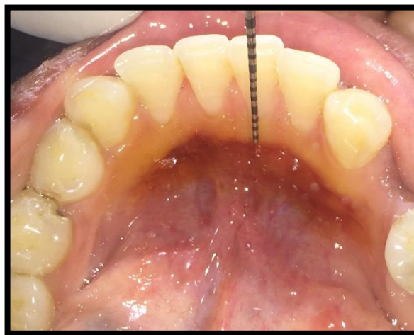
Fig.1:- measuring mean width of lingual attached gingiva lingually after application of lugol's iodine using unc 15 probe.