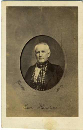
Sam Houston (1793-1863)

After the losses at The Alamo and Goliad, the dashing Sam Houston steps in to lead the Texians.