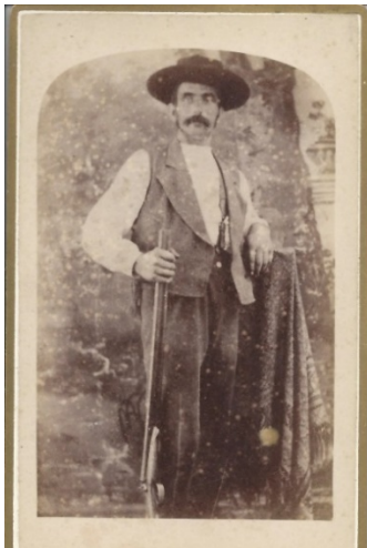
A Mexican Warrior

Mexico is already in the process of trying to regain their land well before the Texians declare their sovereignty.