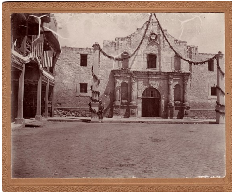
The Alamo Mission Circa 1901 During A Celebration Of The Battle Of San Jacinto

Santa Anna's ruthlessness here will not be forgotten as the Texians prepare to strike back.