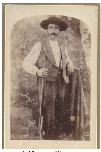
A Mexican Warrior

Mexico is already in the process of trying to regain their land well before the Texians declare their sovereignty. Initial fighting breaks out in October 1835 with the Mexicans intent on driving the invaders back to the US border at the Sabine River.