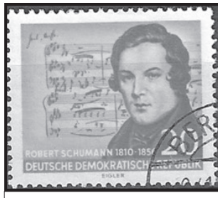
Above: Correct music

A second stamp was reissued on 8 October 1956 with the correct score by Schumann.