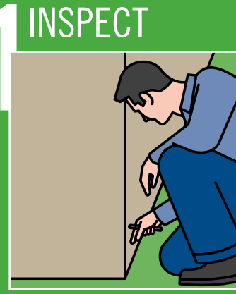
A Certified Sentricon Specialist™ checks for signs of termites.