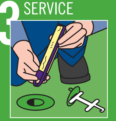
Your Certified Sentricon Specialist makes sure the stations are always working.