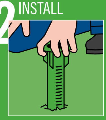
Stations are placed around your home, and the bait immediately begins working.