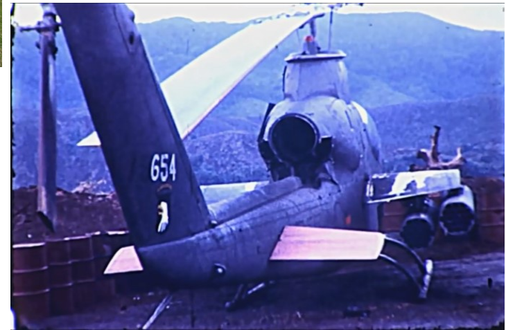
A still from a Vietnam War-era film shows Cobra 67-15654 at Khe San.

"Aerial rocket artillery was a very specific role and there were