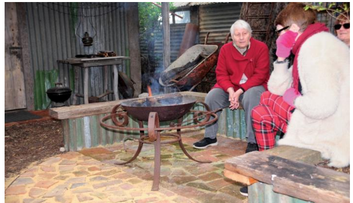
The fire pit was popular on this cold day.