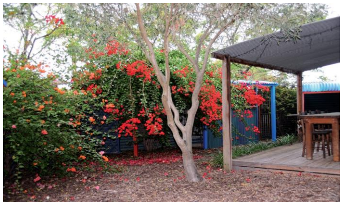
Bouganvillea near the outdoor dining area.