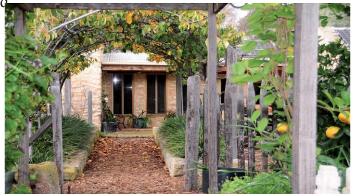
The arched quince walk and the cottage.