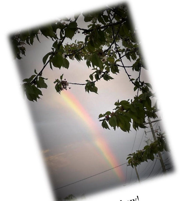
Game time rainbow!