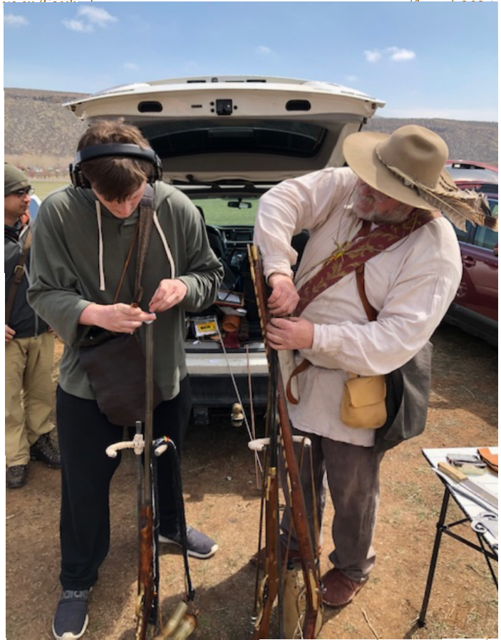
The Master and the Student