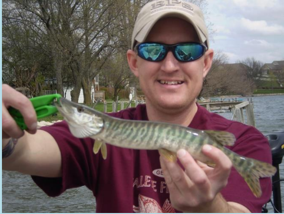
Tiger musky from April 2016 (13 ½ Inches)