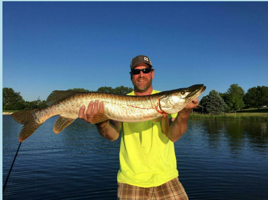
Tiger musky from June 2019 (37 Inches)