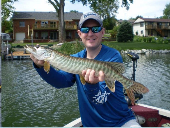
Tiger musky from May 2017 (23 ¼ Inches)