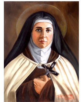
Feast Day: April 12