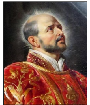
Feast Day: July 31