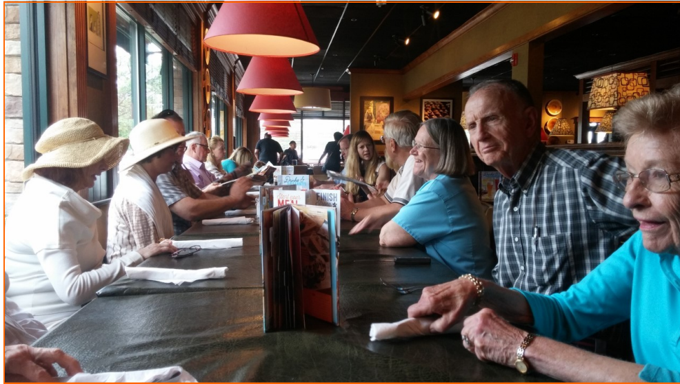
Enjoying fellowship afterwards

amount about the assassination in addition to how travelers were accommodated along the highways of the times. Mary Surratt had the upscale accommodations for men as well as women. The weather continued to be favorable and we headed off to a nearby Ruby Tuesday restaurant for a casual meal and lotsa' fellowship. Altogether the attendees numbered 21 adults and 2 children.