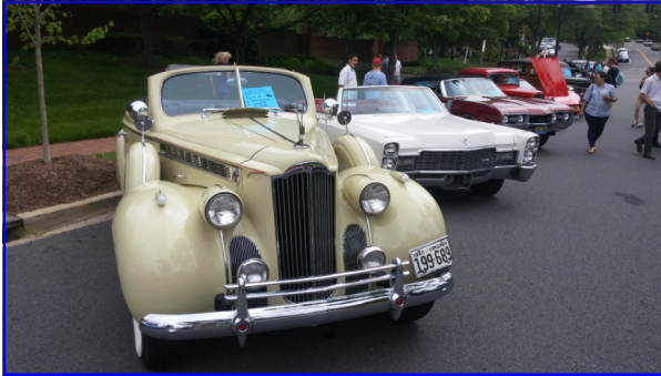
Tom Brooks 1940 Super 8 One Sixty