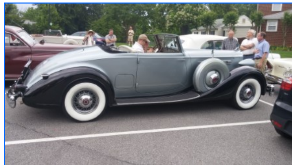
Orin Kerr's 1935 12