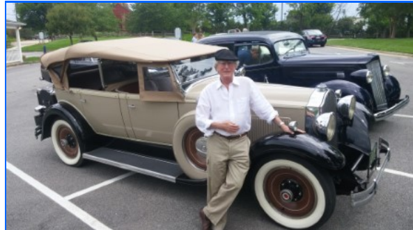
Pierre Gagnon's 1931 8