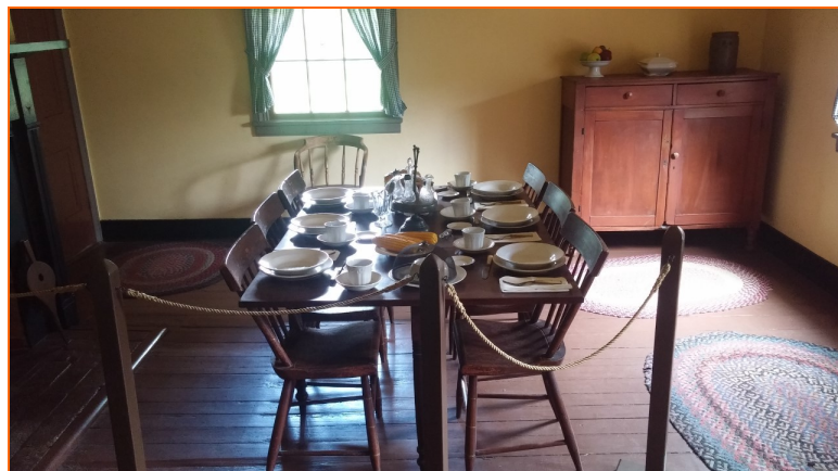
Dining room for boarders

On a rain free Saturday morning, stalwart Packards Virginians assembled in Alexandria to begin the planned weekend wander. 9 Packard cars and one Leland-built