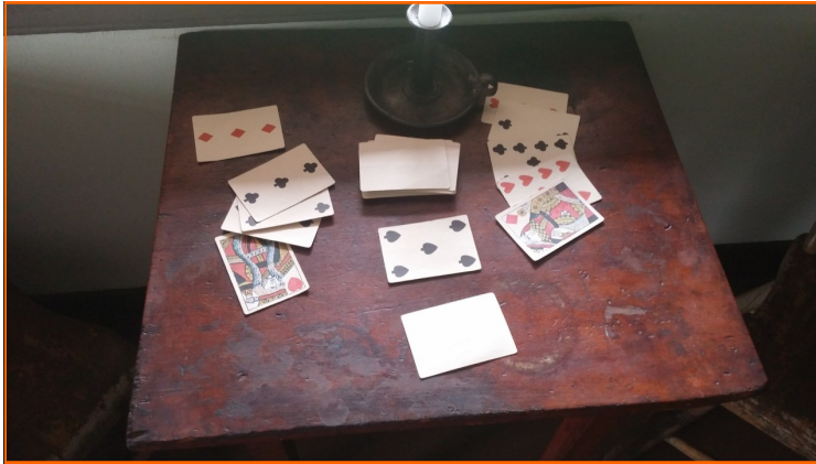
Game table from boarding house

Lincoln participating in chronological order