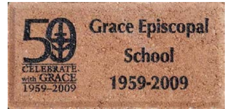
$85 W/ logo