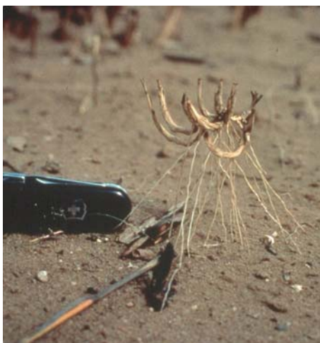
Figure 1. About 50 mm of soil blown from cropland in Kansas during the winter of 1995–1996.

Soil structure influences the ease with which it can be eroded. Soils with medium to fine texture, low organic matter content, and weak structural development are most easily eroded (Bajracharya and Lal, 1992). Typically these soils have low water infiltration rates and, therefore, are subject to high rates of water erosion and the soil particles are easily displaced by wind energy.