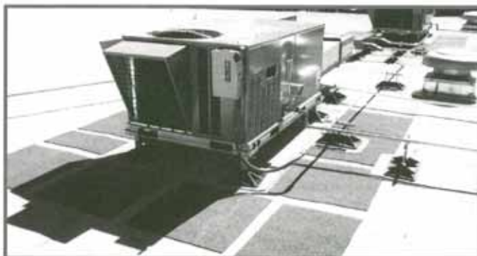
Modified bitumen walk pads around roof-top HVAC unit.

Single-ply membrane manufacturers typically provide walkpads produced from the same material as the membrane. These products are usually provided with a textured or non-slip surface. Walk pads for thermoplastic single-ply membranes commonly have a tread, embossed or gridded type of surface. These types of walk pads are approximately 1/4" thick and 2'x2' or 2'x3' and bonded to the membrane with an adhesive. The pads can also be heat welded directly to the