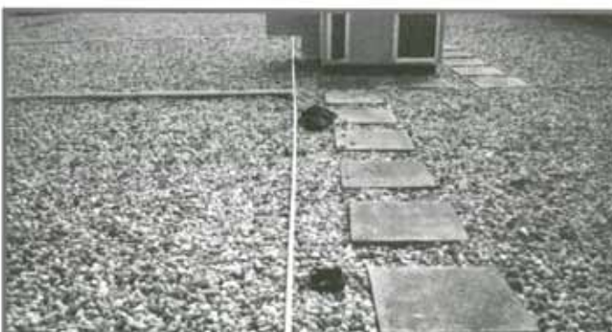
Concrete paver walkway for ballasted EPDM roof system.