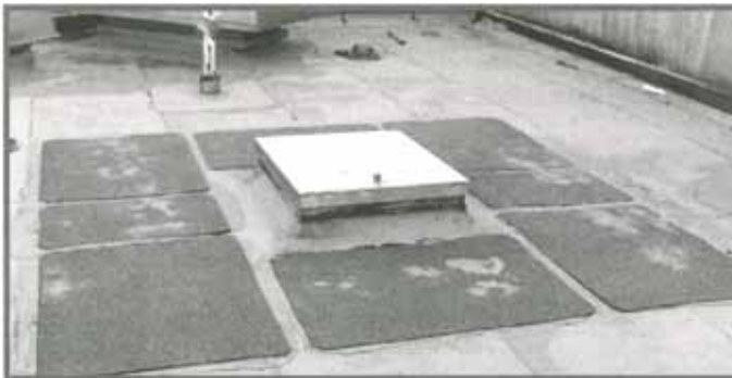
Modified bitumen walk pads around roof hatch.

membrane or attached by tabs that are welded to the membrane. A few examples are "Sarnatred" by Sarnafil, "Hi-Tred Walkway Pads" by JPS Elastomerics, and "Bondgard Walkpads" by Bondcote Roof Systems. The walk pads for EPDM single plies are composed of rubber and often have raised ribs on the top surface. These kinds are approximately 1/2" to 3/4" in thickness and available in sizes of 4'x6', 2'x6' and 3'x4'. They are usually adhered to the surface of the EPDM roof membrane with a contact-type adhesive. A few examples of these are "Molded Walkway Pads" by Carlisle, "Roof-Gard Pads" by Humane Manufacturing, and "Protection Mat" by Firestone.