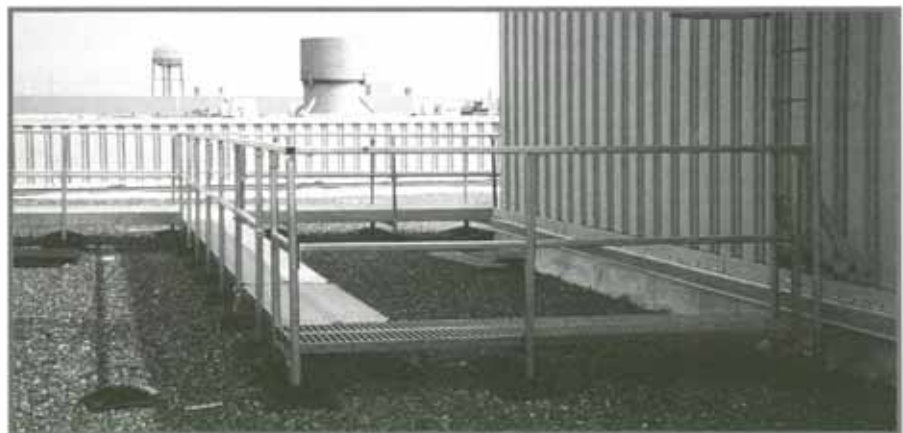
Pre-fabricated metal plank walkway system on built-up roof system.

Walkways traditionally are not installed on metal roofs due to the lack of either rooftop equipment or the degree of slope, or both. However, if required or necessary, metal grating planks such as "Roofwalks" as provided by Unistrut can be installed on the metal roof system. This system consists of planks that are 6" or 9" wide and are roll-formed from either 12, 14 or 18 gauge galvanized steel. The planks are available in 20 to 24 foot lengths. The top of the planks have an open grid grating that provides a 360 degree anti-skid surface. These planks are typically installed over a support system that spans the panel and rests on or is anchored to the standing seams. This system can also be installed on a conventional low-slope roof. This type of application could utilize a steel support structure (steel pipes or tubes) which penetrates the roof and is anchored to the decking or the supports could be set directly on a rubber pad set on top of the roof system. A similar system is also available that does not involve penetrating the roof system. This system was developed by Portable Pipe Hangers and GS Metals and is