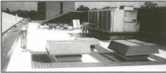
Walk pads with tread-type surfacing for single-ply roof membrane.