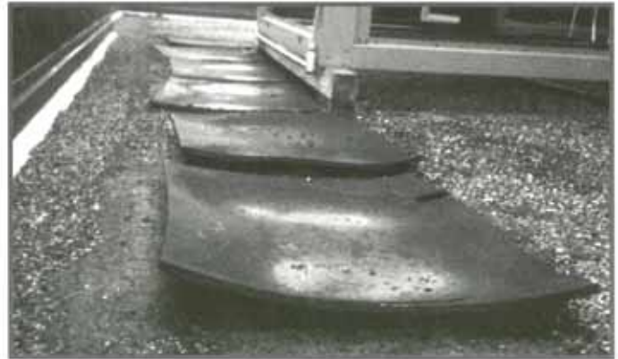
Curled processed rubber walk pads.