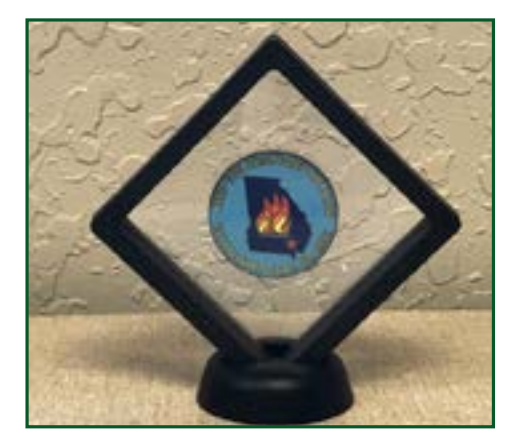
Challenge Coin Back