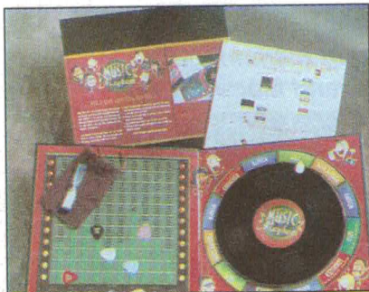
The Music Mayhem board game

Music Mayhem (Booth G215) is the fresh new board game that brings out the music lover in everyone. Whether you're a fan of pop, country, oldies, rap, classical, R & B, blues, show tunes, rock or jazz, Music Mayhem is the delightful board game that will get your feet tapping, fin-