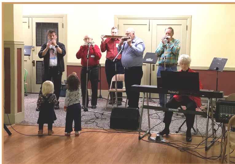
The wonder of children