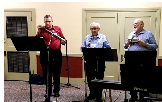
The Twilight Trio