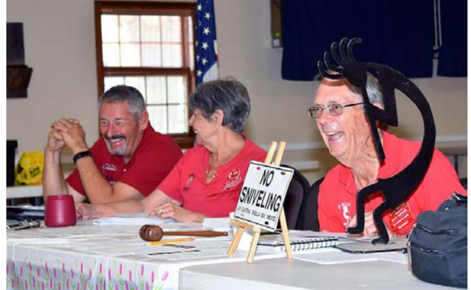
Our Semi Annual Meetings are serious!

Saturday we started our day with scrambled eggs, ham and cheese, fresh fruit, sweet rolls, etc.