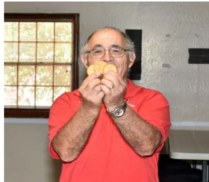
He found them!