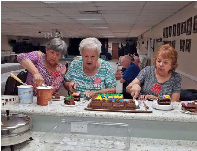
Our Hosts busy serving delicious Cake and Ice Cream