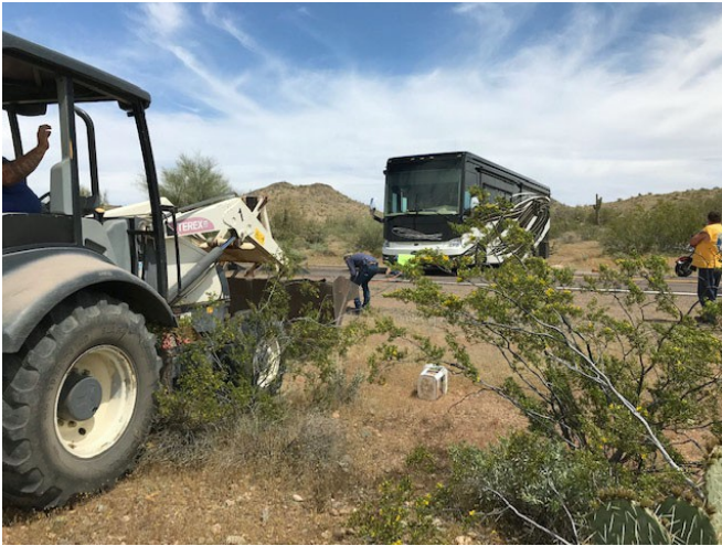
Ultimately several workers from the park pulled her out with a farm tractor.