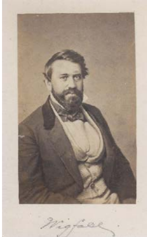
Louis T. Wigfall (1816-1874)

On July 13, General Beauregard decides that it is time to call off the slaughter.