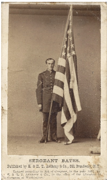
A Staunch Defender Of The Flag

The Sumter garrison has been defeated, but its spirit is not broken, and Robert Anderson insists that the defense they have put up over the last four and one-half months be properly honored.