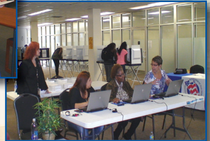
BETHUNE COOKMAN UNIVERSITY