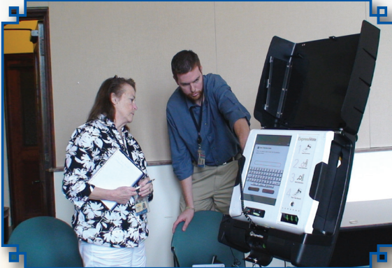
OVERVIEW OF NEW VOTING EQUIPMENT