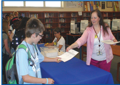
HERITAGE MIDDLE SCHOOL