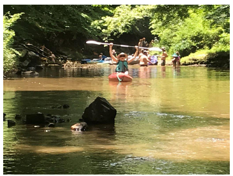
Juanita Tanger on Pigg River Ramble