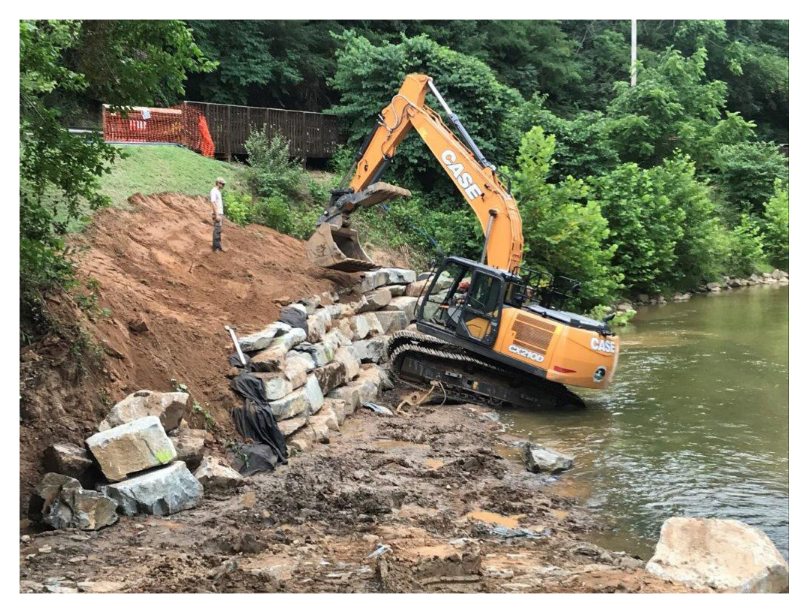
FORVA is restoring a riverbank on the Pigg River in Franklin County. Part of developinga new Franklin County Blueway