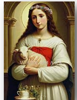
Feast Day: January 21

She died a virgin-martyr at the age of 12 or 13 on January 21, 304. St. Agnes is the patron saint of young girls, chastity, and rape survivors. She is often represented with a lamb, the symbol of her virgin innocence, and a palm branch, like other martyrs.