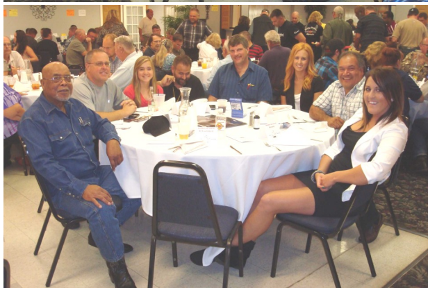
Photos: Southport Masters' Tables FNRA 2013