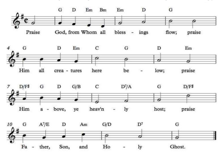
Doxology, written in England for Protestant Churches in 1674.

As the offering is brought forward, we will sing the Doxology.