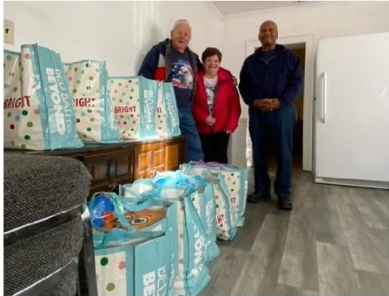
Roma Lodge #254 Food Donation To Vetshouses of Virginia Beach 20 December 2023