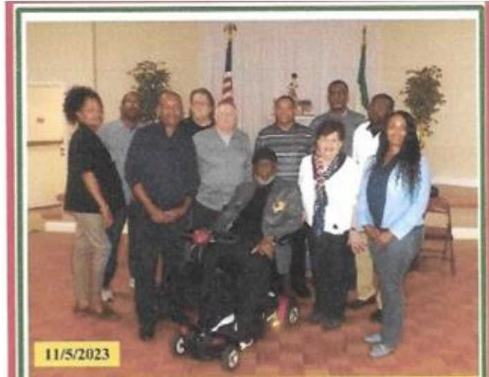
Veterans Day Celebration luncheon for VetsHouse of Virginia Beach and Roma Lodge Veterans (November 5, 2023)

In November we celebrated Veteran's Day at our meeting on the 5 th . We invited the veterans from VetsHouse of Virginia Beach, although only half of their members got there, several got lost and did not make it. We celebrated the visiting veterans and those members of the Roma lodge that are retired or active members of the Armed Forces. On the 17 th of November, we delivered Thanksgiving meals to the Veterans at the VetsHouse. We delivered five turkeys and 10 Bags of food to support the five Veterans houses in Virginia Beach. They were extremely grateful for all the food.