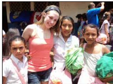
A student from Falher finds friendship

In this issue we feature stories about the experiences of three Alberta delegations