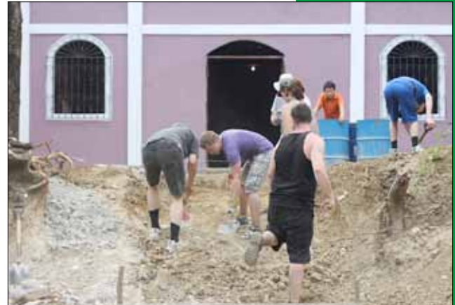
Delegates from Olds work with villagers to construct a ramp leading to the chapel in El Carrao

With God's grace we slowly let go of our preconceived ideas of how we could make a difference in this community. Without our being conscious of it, the villagers' faith and attitude began to have a deep impact on each one of us.