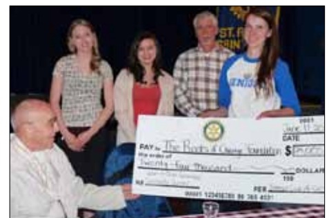
Father accepts a cheque from SACHS students

Two hundred students raised at least $100 apiece to qualify as participants in the Wake-a-thon. The funds are earmarked for a community centre in Belén.