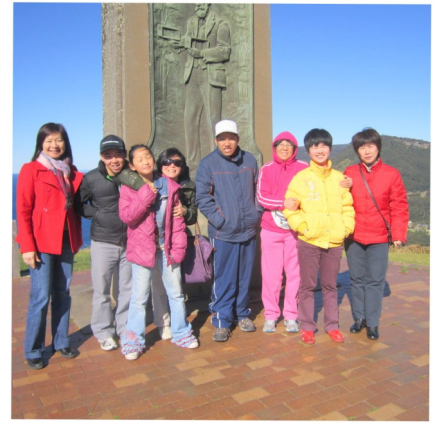
FATHER'S DAY TRIP