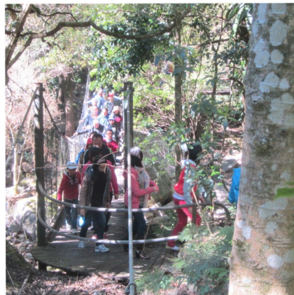
FATHER'S DAY TRIP