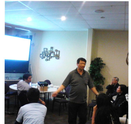
DAD TO DAD