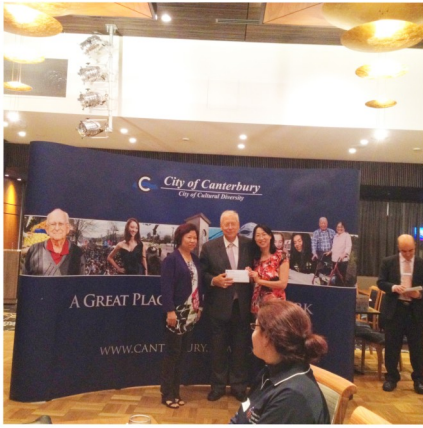
REPRESENTATION AT CANTERBURY CITY COUNCIL