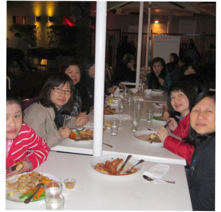
MUM TO MUM