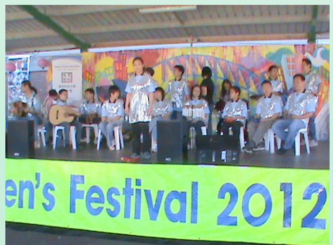
Canterbury Children Festival 2012