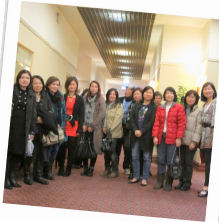
MUM TO MUM