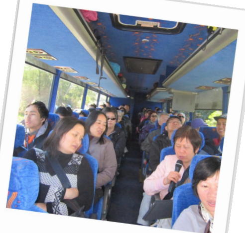
FATHER'S DAY TRIP