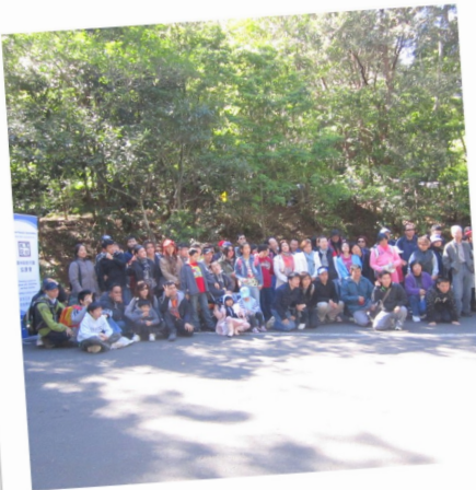
FATHER'S DAY TRIP