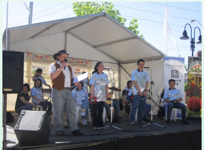
Granny Smith Festival 2012