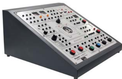
Dimensions: 12"H x 24"W x 24"D Shipping Weight: 90 lbs.