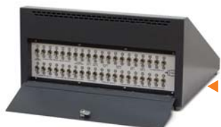
Shorted and open components and circuits are simulated with fault switches on rear of unit.