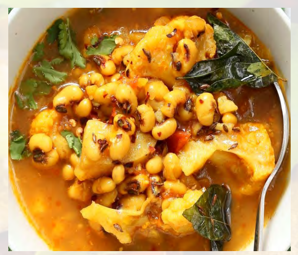
Black-Eyed Pea Curry Vegan Richa