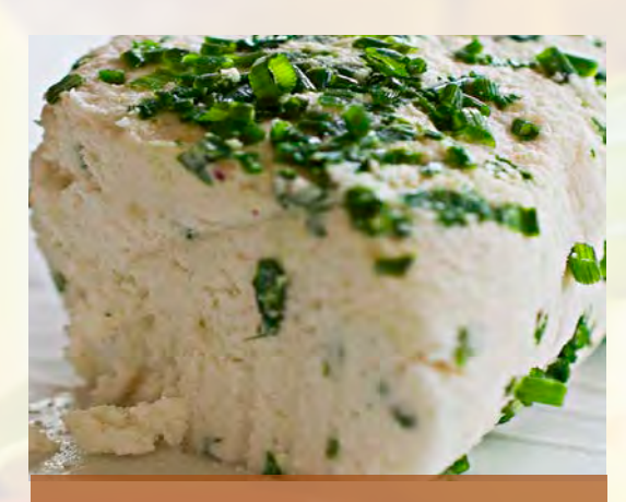
Goat Chive Vromage.com