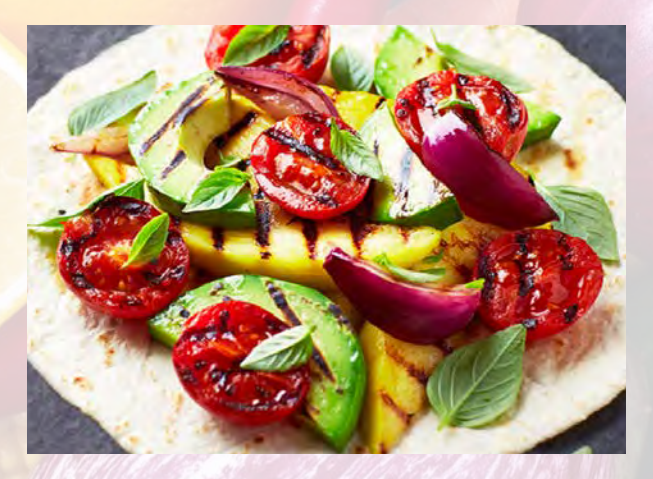
Fiesta Fajitas UCDintegrativemedicine.com