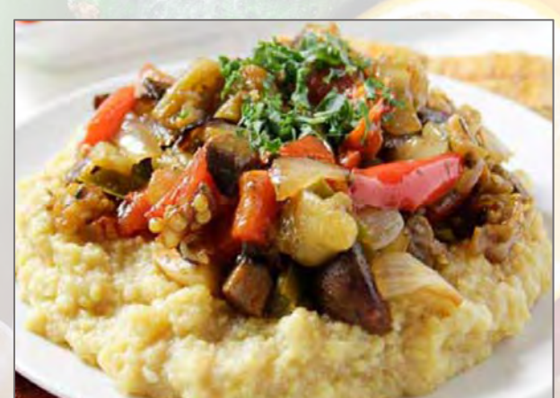
Ratatatouille with Creamy Polenta