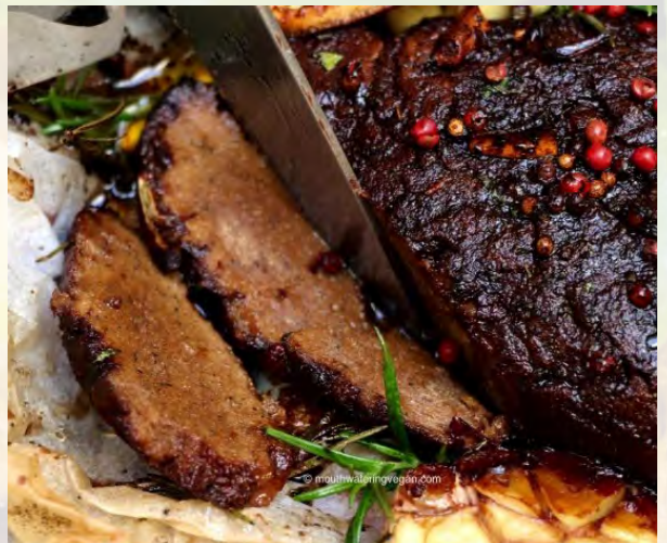
Vegan Greek-Style Roast "Lamb" (Kleftiko) Mouthwateringvegan.com