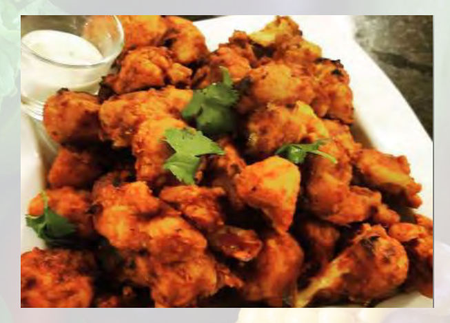
Buffalo Cauliflower RubyLathon.com

Kale Salad with Roasted Butternut Squash and Sriracha Vinaigrette OneGreenPlante.org