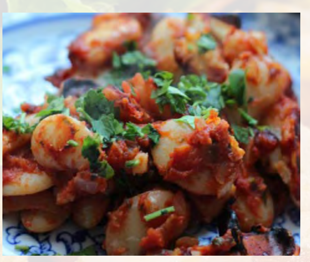
Greek Taverna Baked Beans