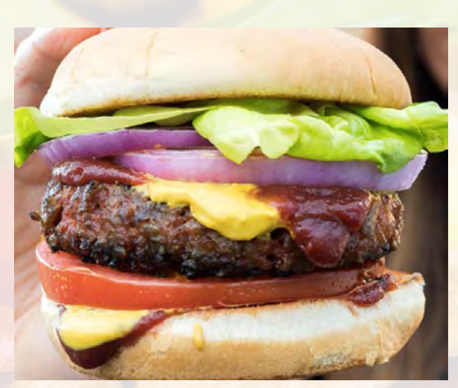
Beyond Meat Burger BeyondMeat.com