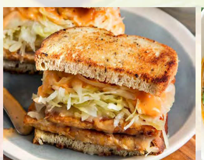
Tempeh Reuben Vegetarian Times