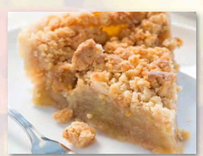
Dutch Apple Pie glutenfreeonashoestring.com