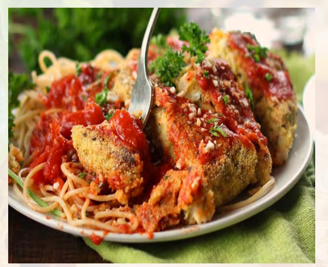
Vegan Chickpea Parmesan