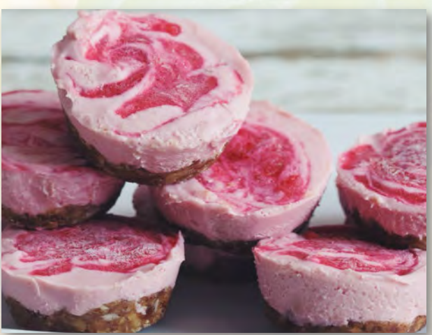
Strawberry Cheesecake Bites foodnetwork.ca