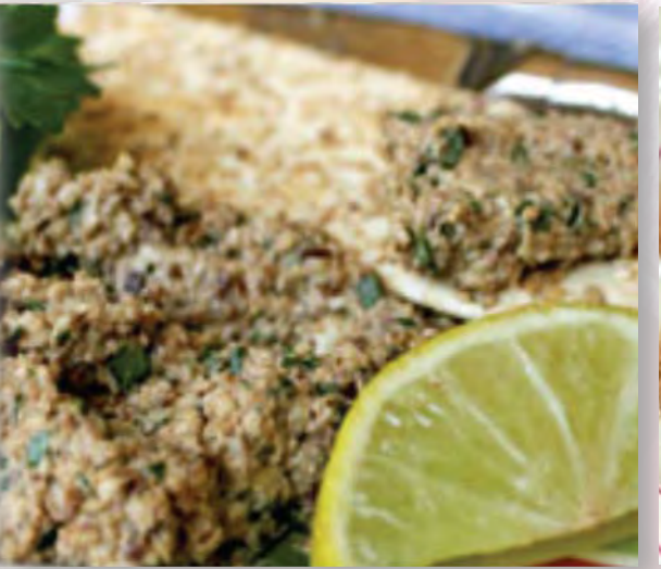
Walnut Olive Spread savvyvegetarian.com