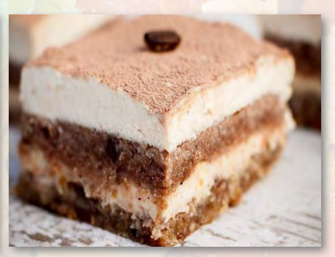
Raw Tiramisu