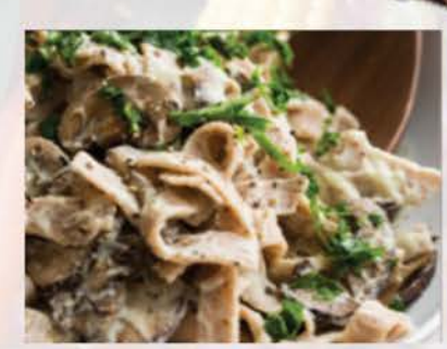
Cauli-Power Fettuccine "Alfredo" OhSheGlows.com