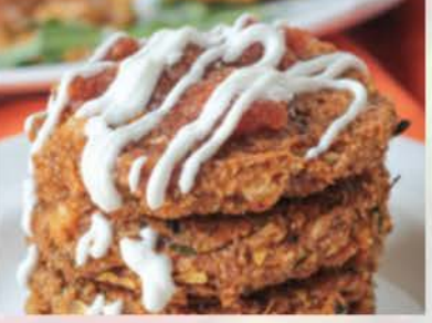
Baked Zucchini and Amaranth Patties OneGreenPlanet.org