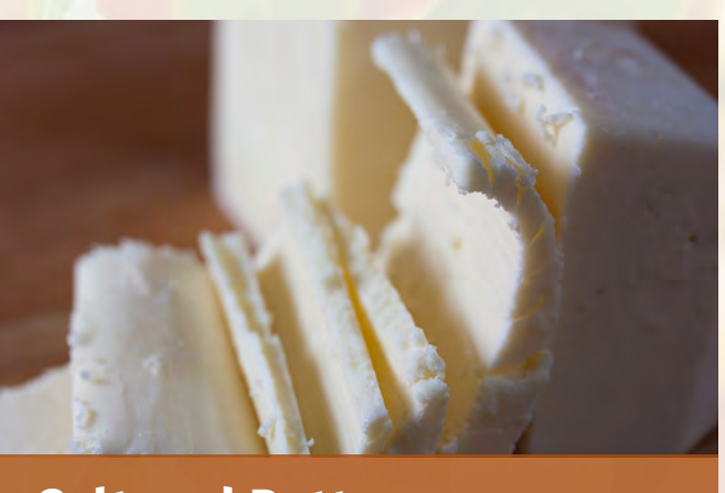
Cultured Butter MiyokosKitchen.com