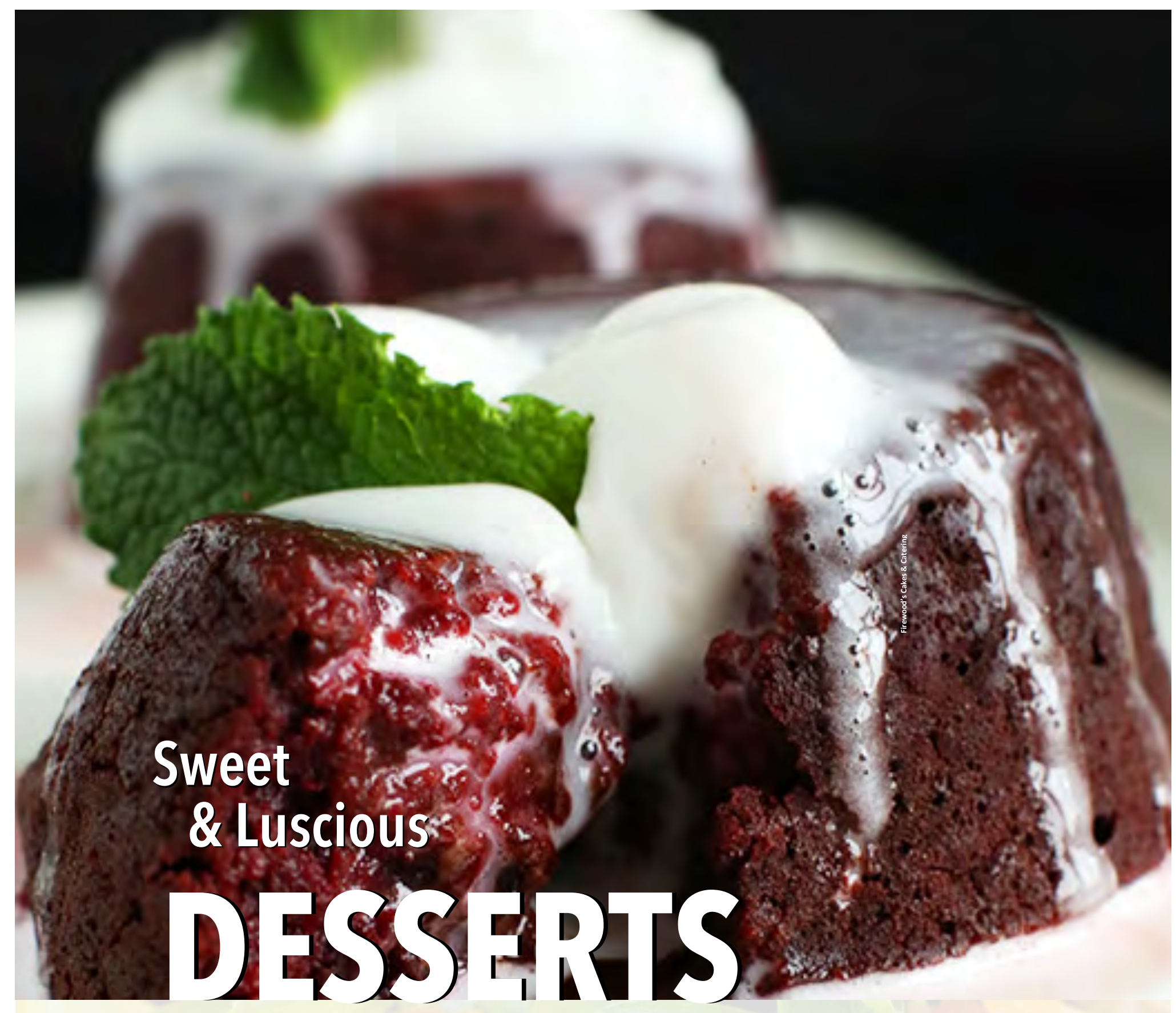
Chocolate Lava Cake minimalistbaker.com