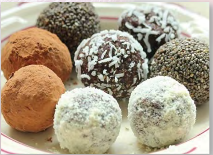
Chocolate Truffles nuts.com