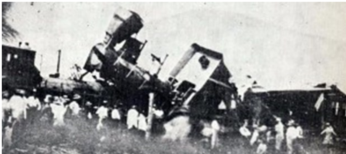
The Secaucus wreck of May 6, 1853. 46 killed in a 'cornfield meet' (two trains on one track) one of the worst of the deadly crashes in that year of catastrophes.

Then came the real disasters. In April, a Chicago crash killed twenty-one. Only a few days later, at Norwalk, Connecticut, a train went through an open drawbridge and drowned forty-six. Public opinion turned sharply against the railroads. Within a month, a head on collision at Secaucus, New Jersey, killed forty-six. Late summer of that year brought more deaths as passenger traffic increased with vacation excursion trains. It might seem inexplicable that after decades of relatively safe operation, the railroads suddenly became death traps in 1853, but there are explanations.