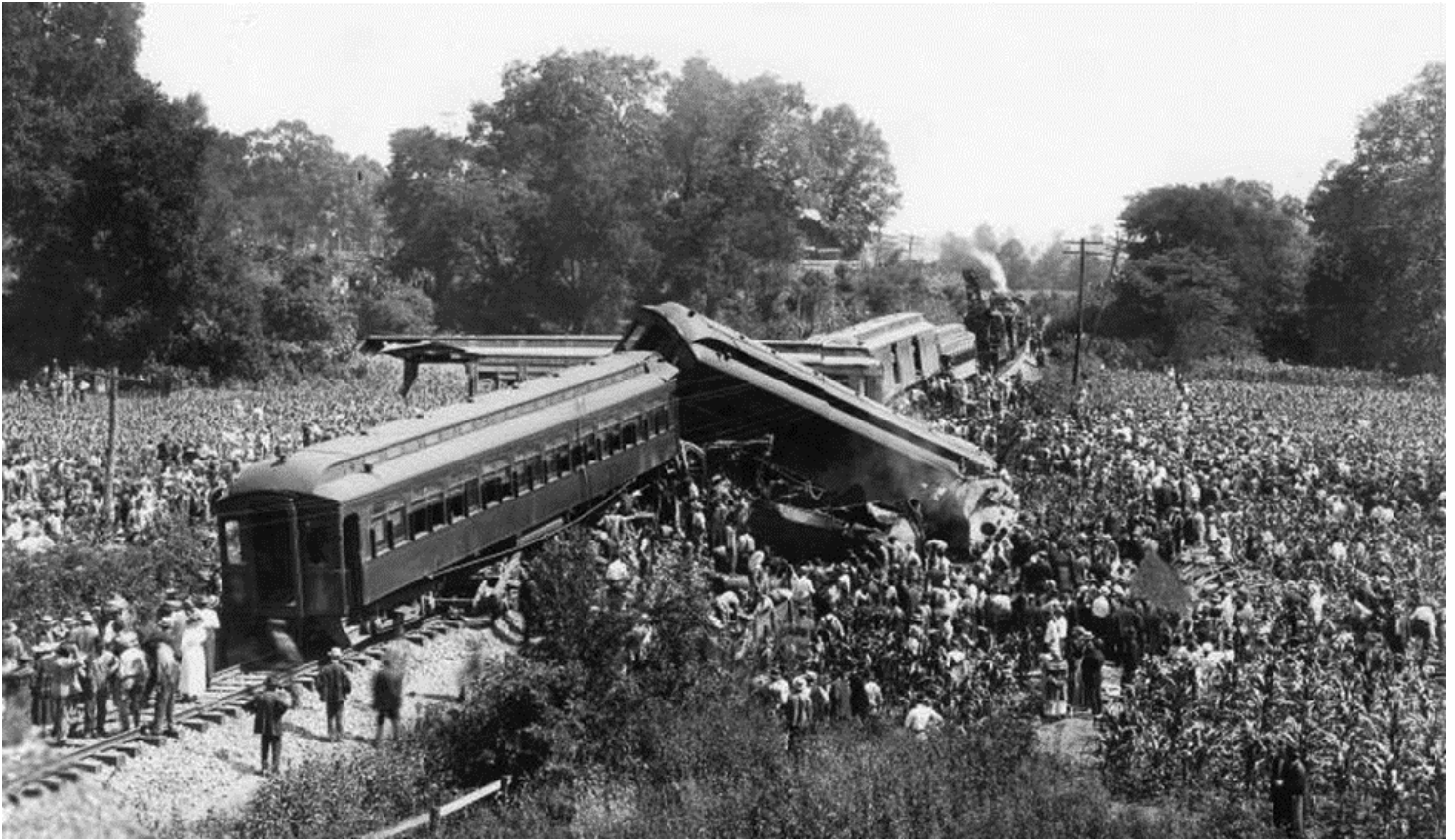
Nashville 1918, two passenger trains at 50-60mph collide head-on killing more than 100. Blame settled on tower operator error. Considered the worst rail accident in U. S. history.

The litany of mayhem and death rolled on through the rest of the 19 th century and into the 20th: 1855 the Gasconade (35 dead); 1856 Whitemarsh Township (60 dead); 1876 Ashtabula (92 dead).