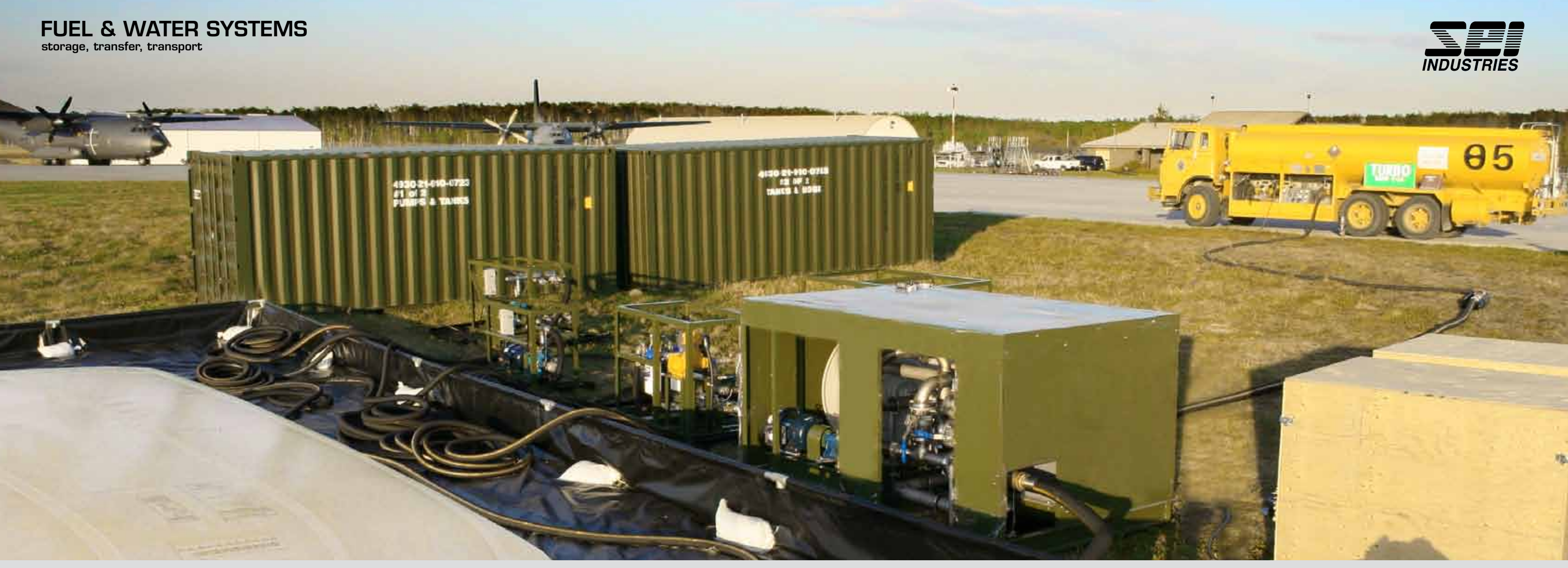
SEI fuel storage and transfer system deployed at Cold Lake, Alberta. System contained: four 24, 000 USG (90,800 L) Arctic King Tanks, a 185 USGPM (700 LPM) electric powered High Pressure Aviation Refueling System (HPARS), Insta-Berm (framed supported) and a RainDrain rain water filtration system.