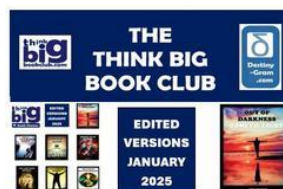
AI-Profiling Website & Books on Destiny