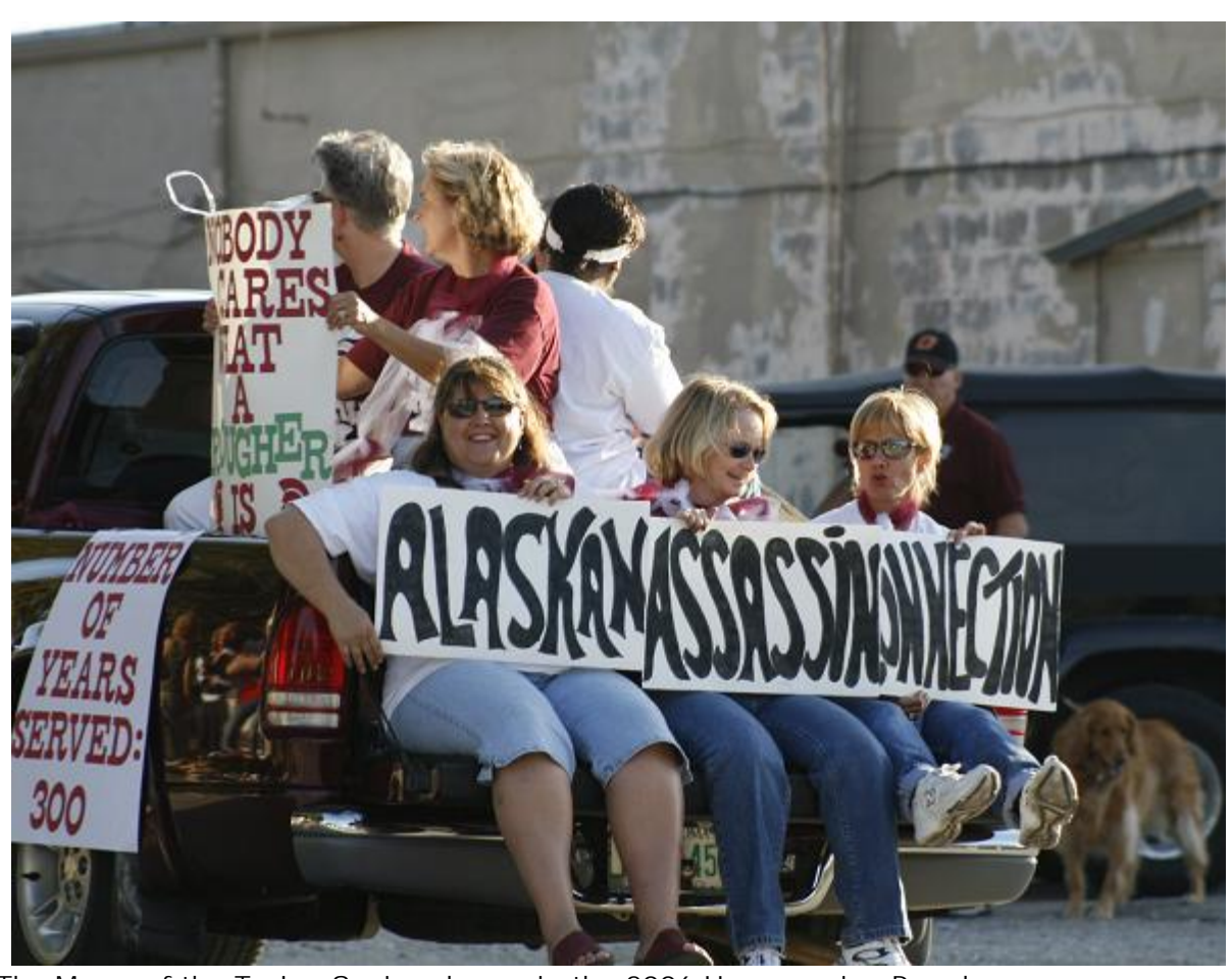
The Moms of the Trojan Senior players in the 2006 Homecoming Parade.