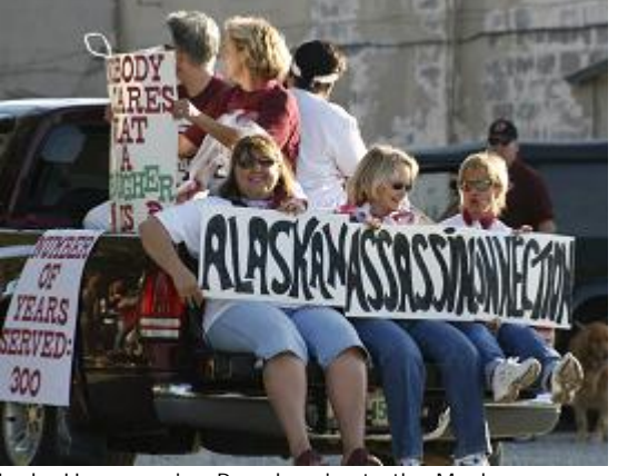
Jenks Homecoming Parade prior to the Muskogee gaem