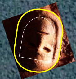
El Castillo FACE OF ALA-LU