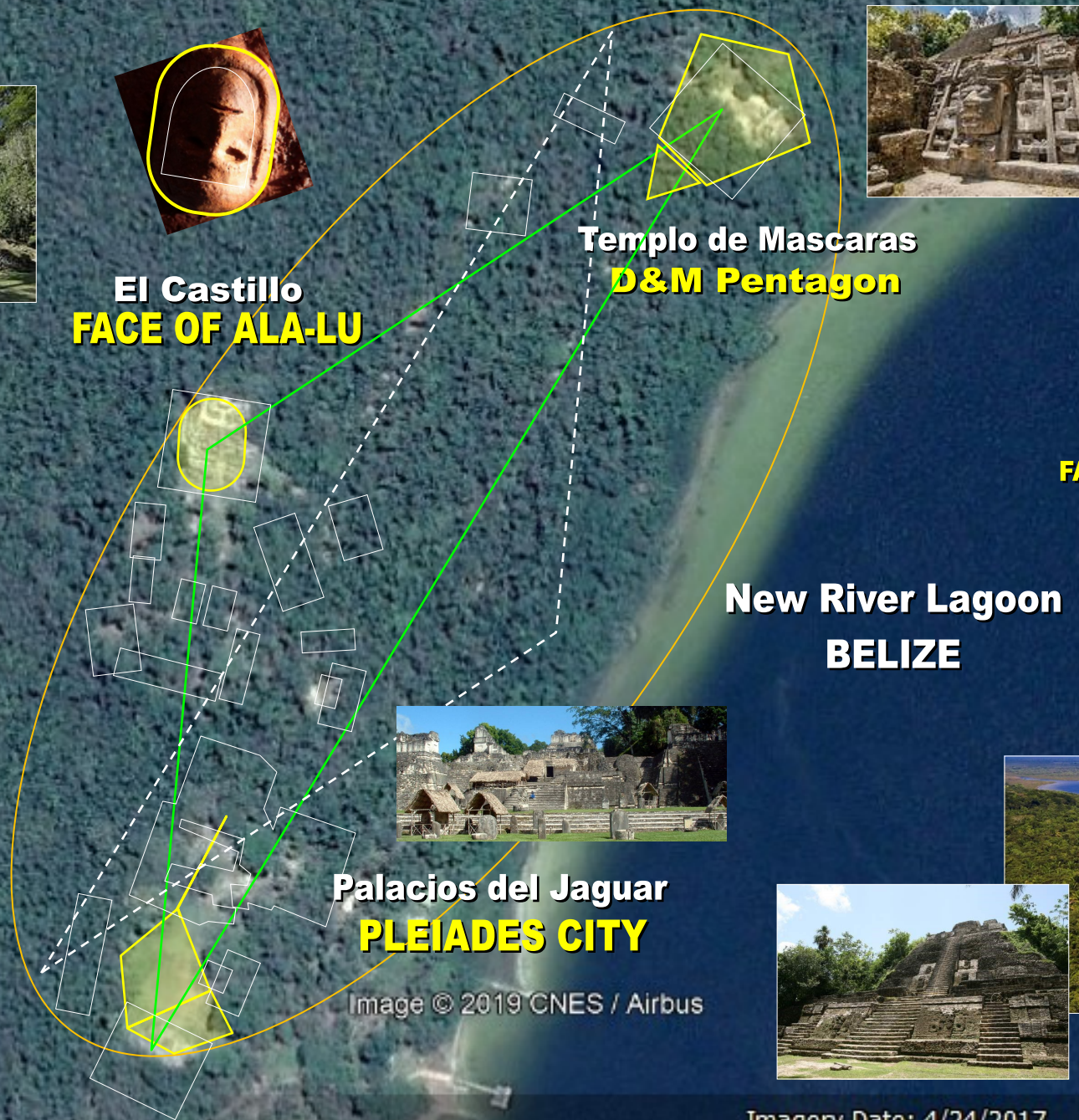
New River Lagoon BELIZE