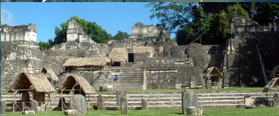
Palacios del Jaguar PLEIADES CITY