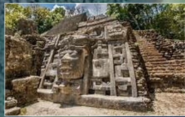
Templo de Mascaras D&M Pentagon