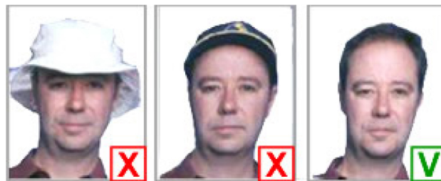
на голові капелюх