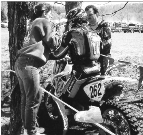
The new scoring system!