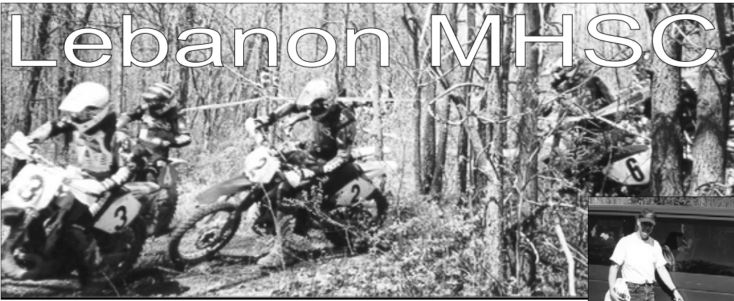
AA riders take to the woods in the first corner.

I'll run complete results with the official report in next month's issue.