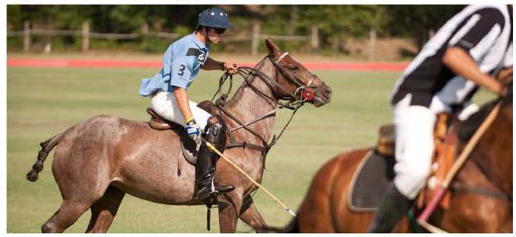
Horse and rider work as a unit at Prestonwood Polo & Country Club.