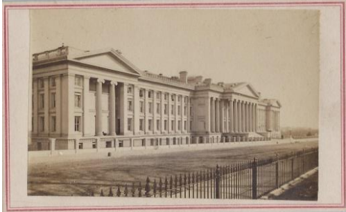
United States Treasury Building

With the Second Bank defeated, the ex-military General serving as President continues his assault on conquering the federal debt.