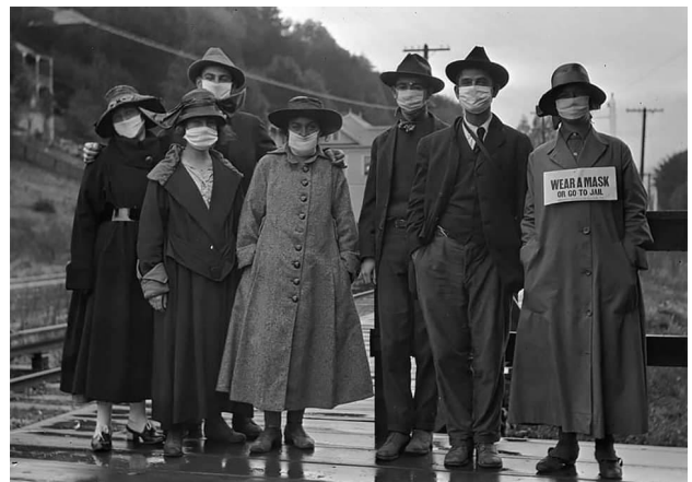
People wearing masks during the 1918 pandemic.

To see SI Manchester's newsletter, click here.