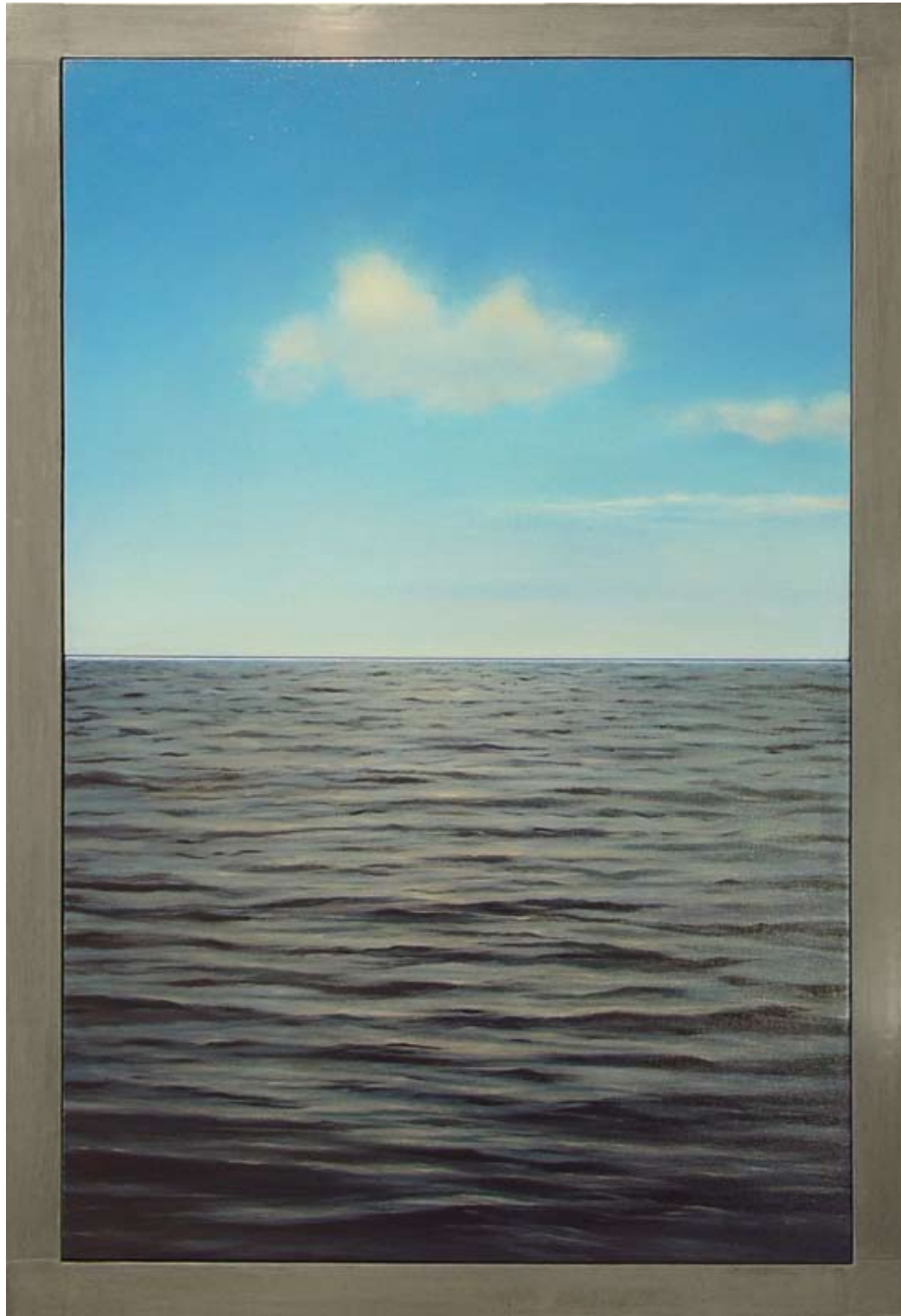
AIR AND WATER #1, 2008, oil on canvas - 2 panels joined and framed in lead, 48 x 33½ x 2 in. 123 x 85 x 5 cm.