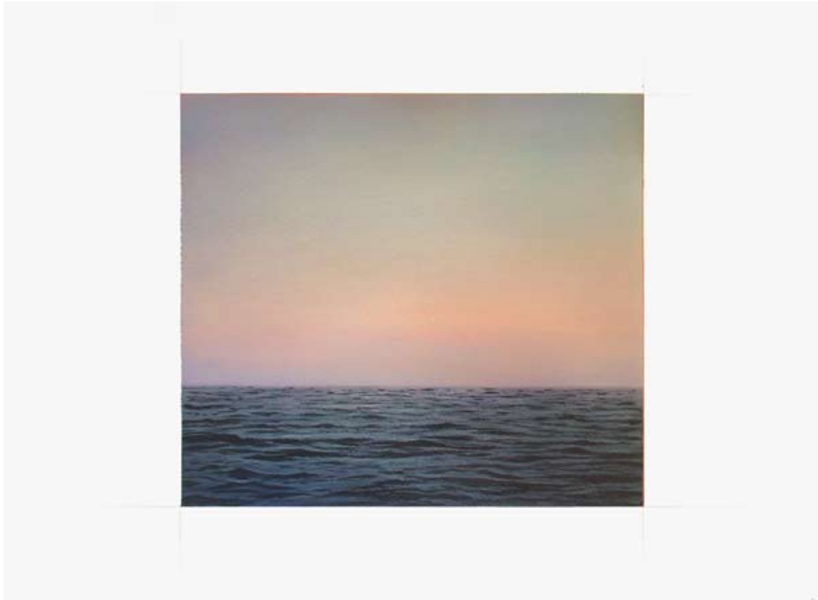
OPEN WATER - EVENING, 2007, oil on paper, 22 x 30 in. 56 x 76.2 cm.