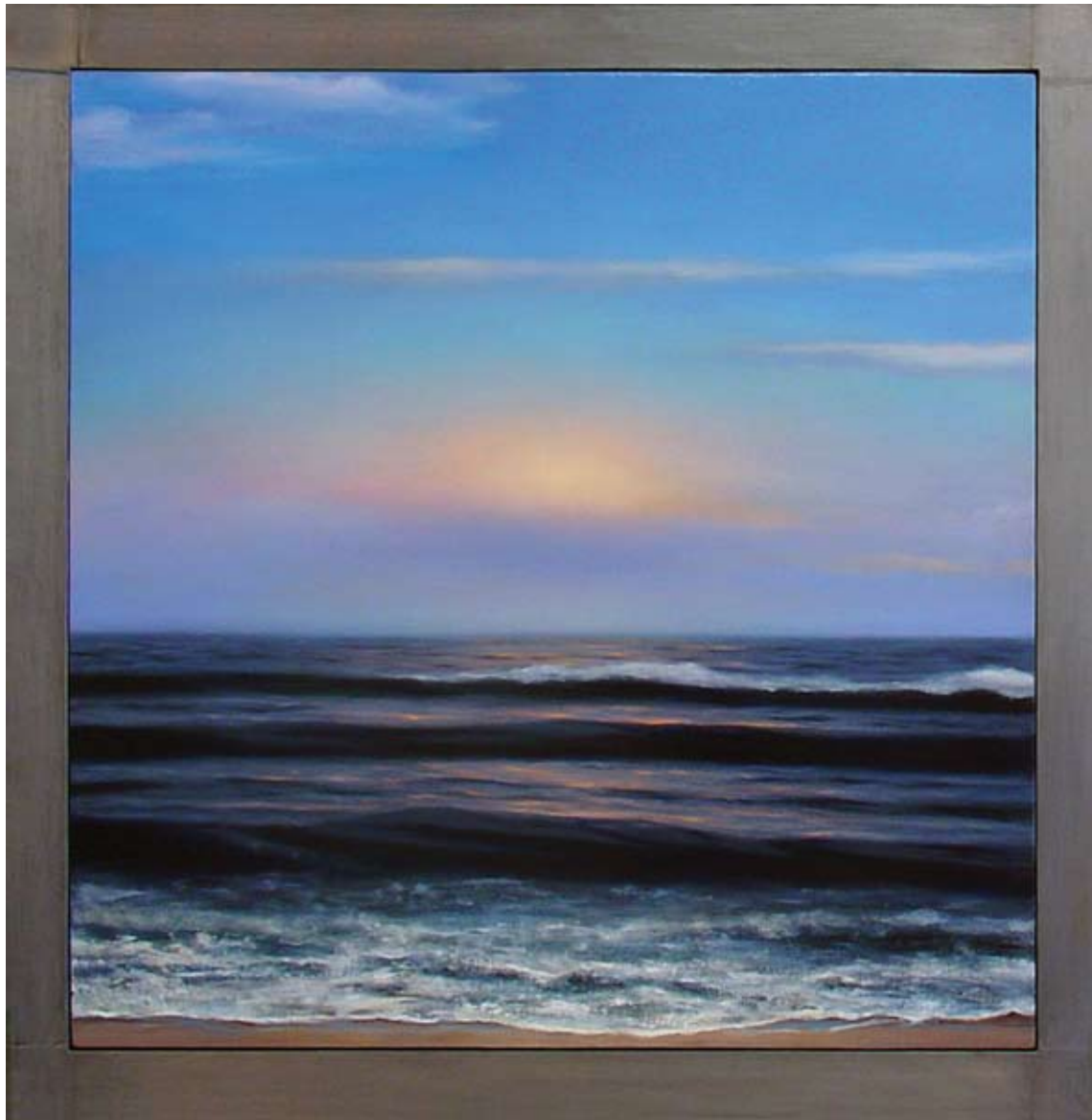
SHORELINE, 2008, oil on canvas framed in lead, 35 1/4 x 33 1/4 x 2 in. 89.5 x 84.5 x 5 cm.