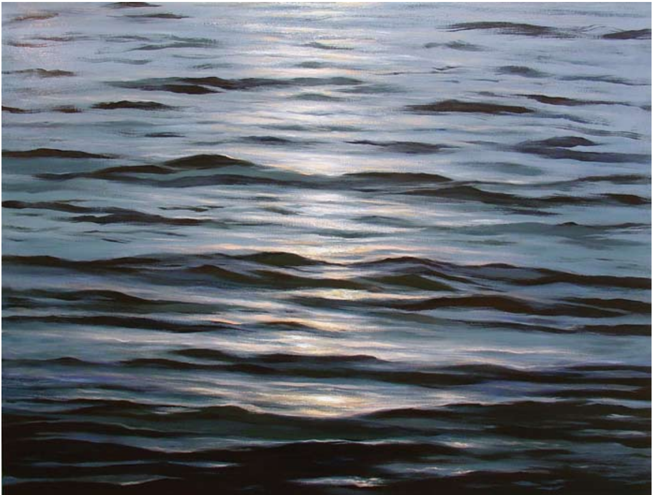
WATER, 2008, oil on canvas, 34 1/4 x 45 1/4 x 2 in. 87 x 115 x 5 cm.