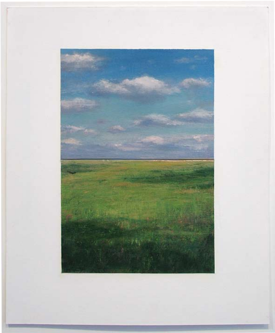
EARTH AND AIR: BLUE SKIES AND GREEN PASTURES, 2008, oil on canvas mounted on matt board, dyptich, 20 x 16 in. 50.8 x 40.6 cm.