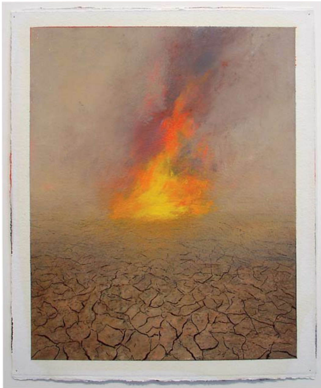
FIRE AND EARTH, 2008, oil on paper, 18 x 15 in. 46 x 38 cm.