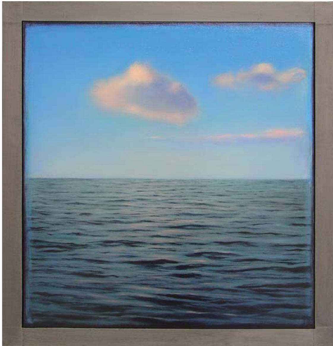
AIR AND WATER #2, 2008, oil on canvas framed in lead, 35 x 33½ x 2 in. 89 x 85 x 5 cm.