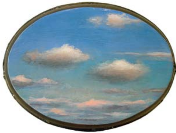
AIR, 2008, oil on lead, 4 x 5½ x 1 in. 10.2 x 14 x 2.5 cm.