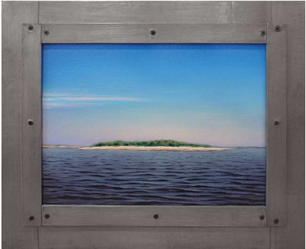
WARNER ISLAND, SHINNECOCK BAY - L.I., 2008, oil on canvas encased in lead, 17 x 21 x 2 in. 43.2 x 53.3 x 5 cm.