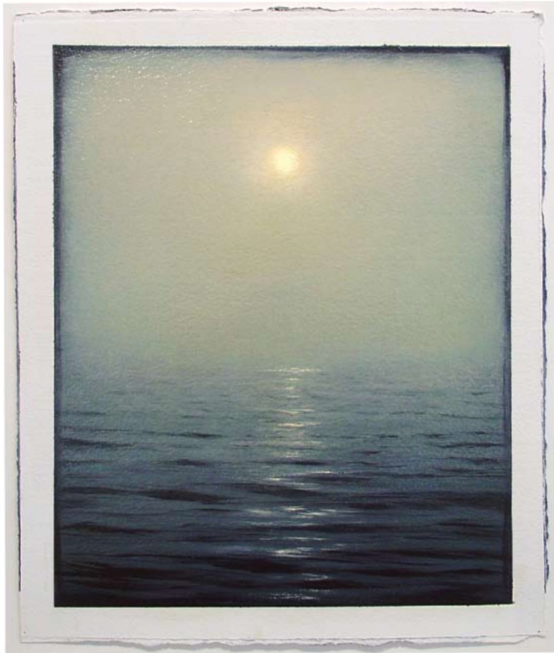
WATER INTO VOID, 2008, oil on paper, 18 x 15 in. 45.7 x 38 cm.