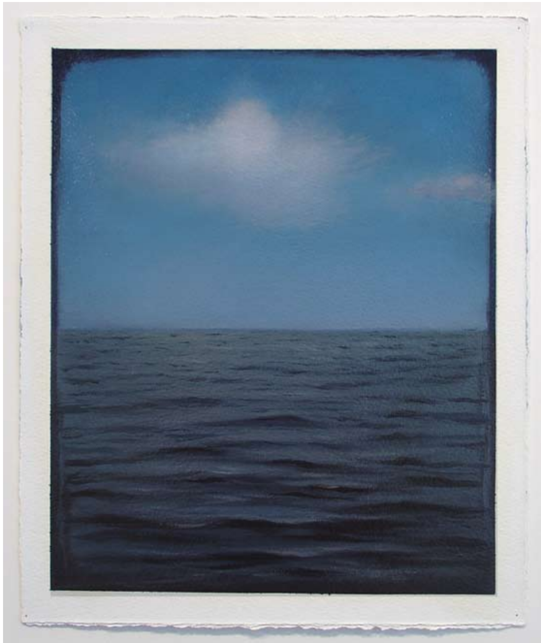
AIR AND WATER, 2008, oil on paper, 17 \frac{3}{4} x 15 \frac{1}{2} in. 45 x 39.4 cm.