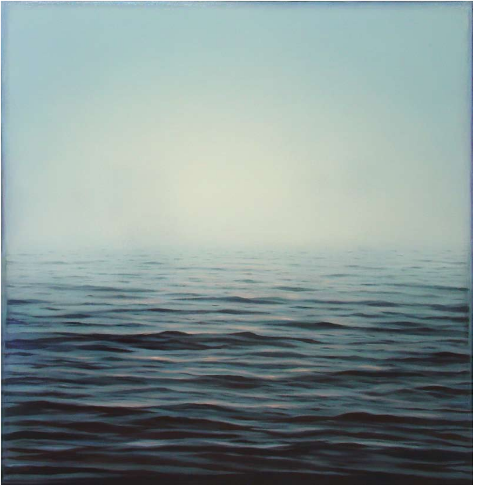
WATER INTO VOID, 2008, oil on canvas, 63 x 58 x 2 in. 160 x 147.3 x 5 cm.