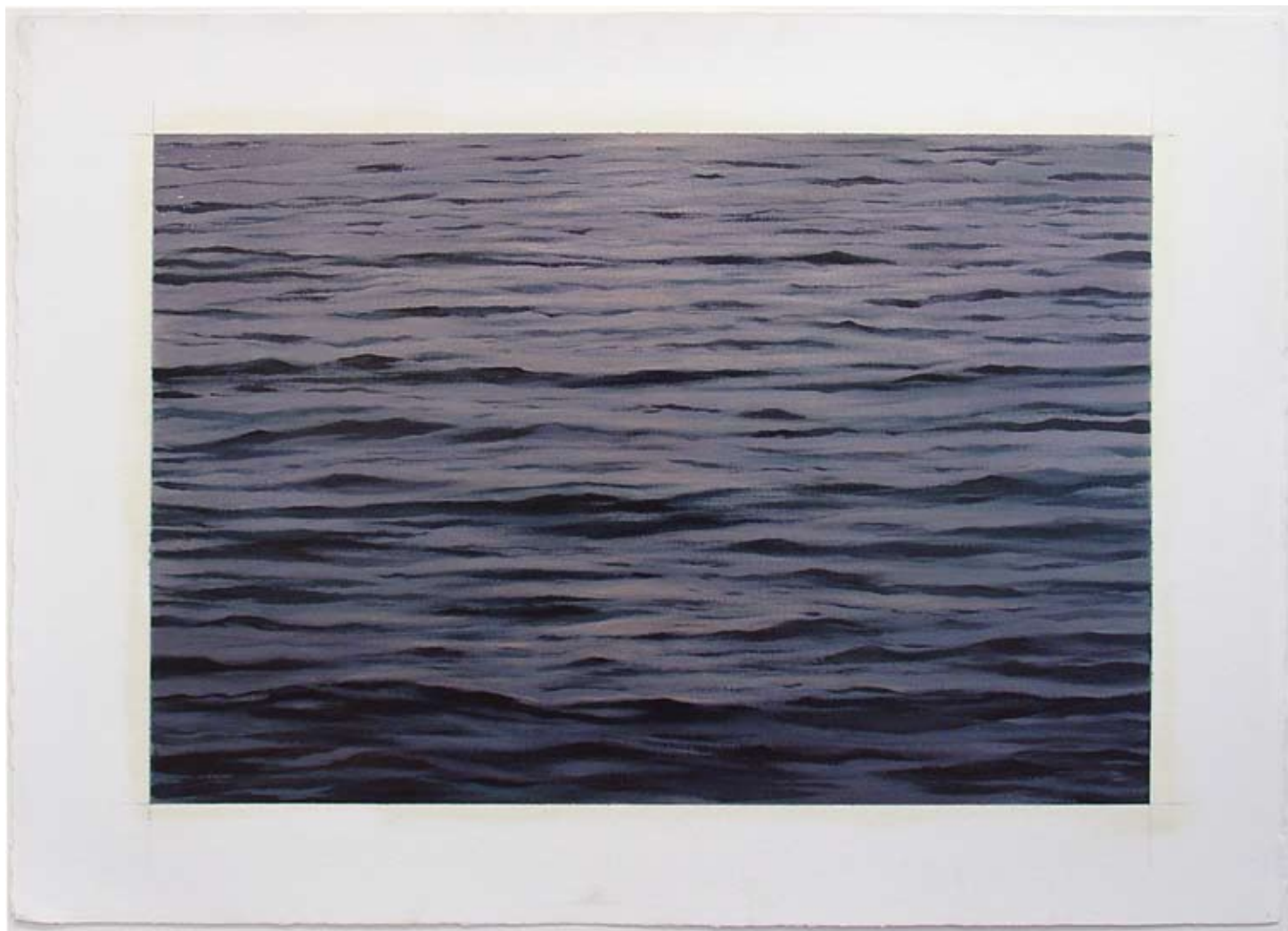
LONG ISLAND SOUND AFTER SUNSET, 2006, oil on paper, 30 x 42 in. 76.2 x 106.7 cm.