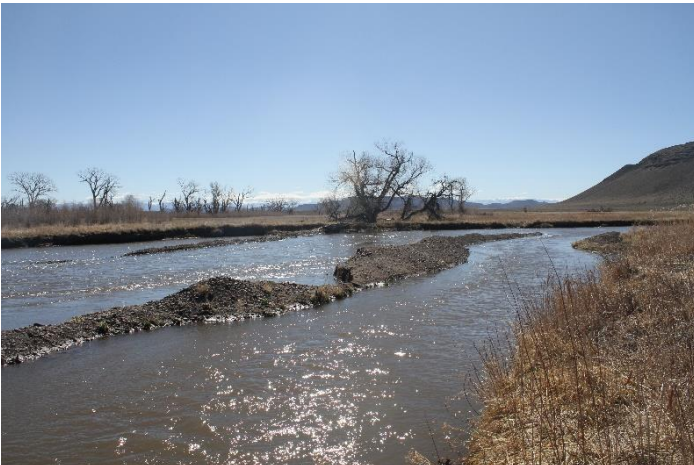
Diversion dam looking upstream