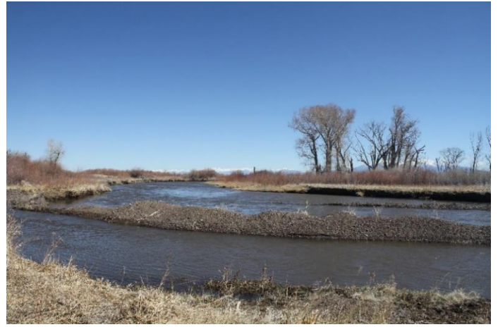
Diversion dam looking downstream