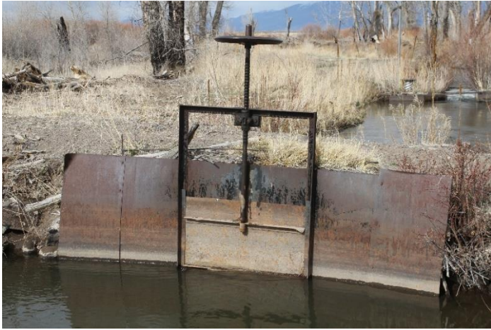
Headgate looking downstream