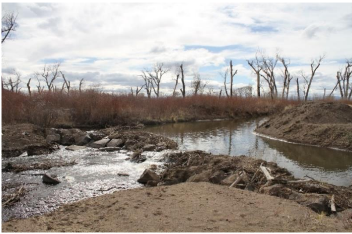
Diversion dam on feeder ditch