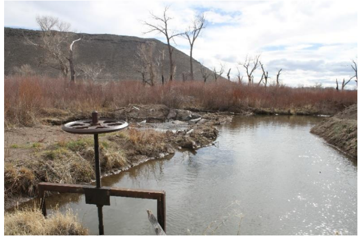
Headgate and diversion dam (on feeder ditch)