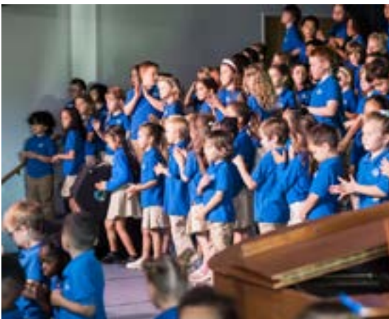
Above: Mom's Chapel