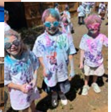
Above and left: Colors War