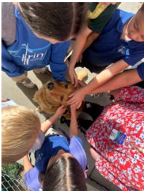
Above: Some TCS students pray for our service dog, Biscuit, during the National Day of Prayer.