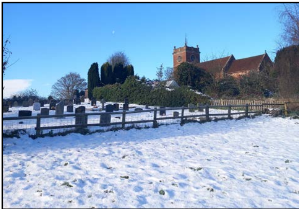
St. Andrew's in winter.